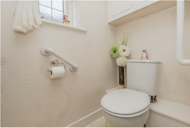
Double glazed window, low flush WC