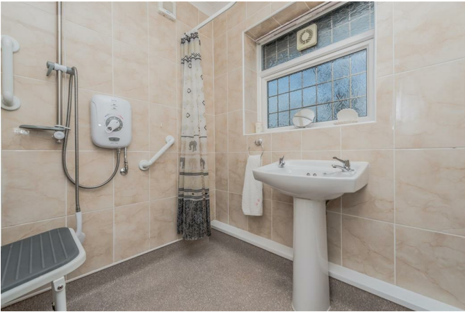
Double glazed window, electric shower, wash basin, ladder style central heating radiator